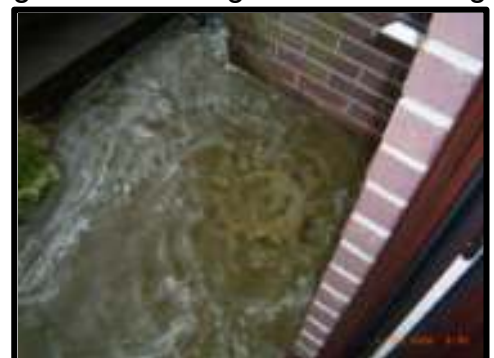
Figure 1. Flooding due to a blockage

Each year over 100 000 blockages occur within the sewer network in England and Wales and of these between 2% and 4% lead to internal flooding of properties. A similar percentage of blockages account for 30% of all pollution events and the remainder cause either external flooding (see Figure 1) or surcharging events.